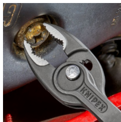
82 01 200 Grips seized components in the most common sizes with widths across flats of 4 – 22 mm